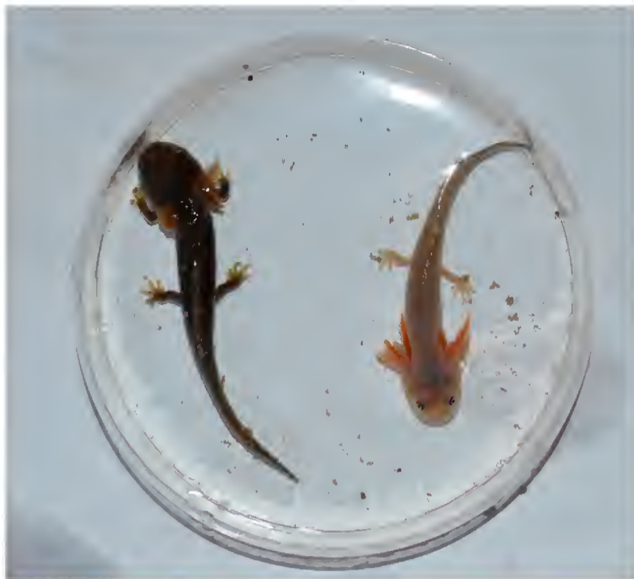
Fig. 7. Dark and light phenotypic variations of Tylostotriton vietnamensis found at the type locality.

egg ready to hatch measured 10.10 mm and weighted 0.56 g. Measurements from random eggs in the field showed an egg diameter ranging between 6.06–13.58 mm (mean 9.73 \pm 1.61 mm, n = 133 ) and weight ranging from 0.19–1.15 g (mean 0.48 \pm 0.21 g, n = 133 ). Eggs were transparent and clear shortly after egg deposition and later changed to brownish transparent.